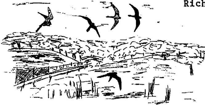
A Fine Way to See Clovelly !

Viewed from the sandstone cliffs above Westward Ho !, the brooding slab of rock that is Lundy squats massively on the horizon, 18 miles out in the Bristol Channel. It appears at this distance much as a sperm whale might to a watcher from the crow's nest, with its blunt brow, high plateau and flukes of rocks at its northern end, a likeness heightened by the slim white tower of the Old Light spouting mistily from the hump. But it wasn't whales that we were after, or Lundy's luxuriant thyme, thrift and bluebells. The island has one of the densest populations of sea birds around these shores, and it was to observe some of the 100,000 breeding pairs, and perhaps to intercept some of the exciting spring migrants passing through, that we deposited ourselves manfully, if somewhat hungrily, on Bideford Quay at 4.30 am.