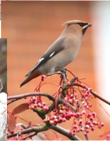
<< Snow Bunting