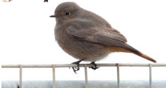
Black Redstart >>