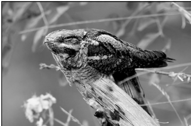
European Nightjar, sadly not in Sussex! May 2010