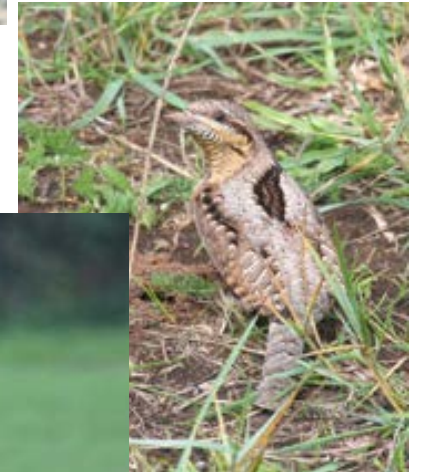
<< Short-eared Owl